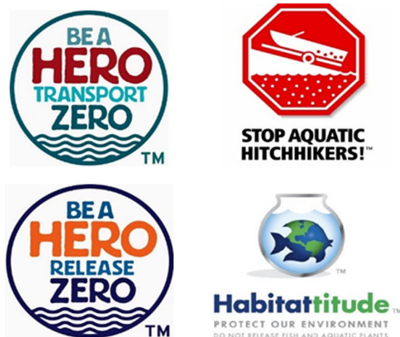
Fig. 1 State-level and national-level AIS campaign logos

the organisms-in-trade audience in mind. Third, a group associated with the U.S. Fish and Wildlife Service and other federal agencies, the Aquatic Nuisance Species Task Force, developed the “Stop Aquatic Hitchhikers” campaign in 2001 to educate recreationists about preventing the spread of AIS. Finally, the “Habitattitude” campaign was created by the Aquatic Nuisance Species Task Force in 2004 for organisms-in-trade hobbyists. Thus, there were two state-level and two national-level campaigns aimed at the same audiences; these campaigns were designed for behavior change among recreationists (Connelly et al. 2014) and hobbyists (Lauber et al. 2015).