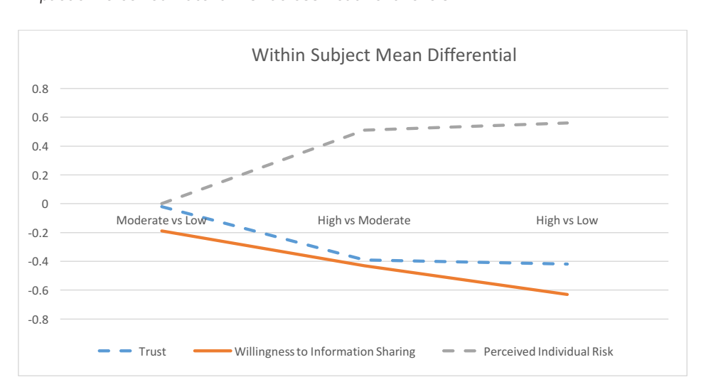
Figure 2 Impact of Perceived Material Risk across Treatment Levels

*Significant difference between the perceived material risk treatment level