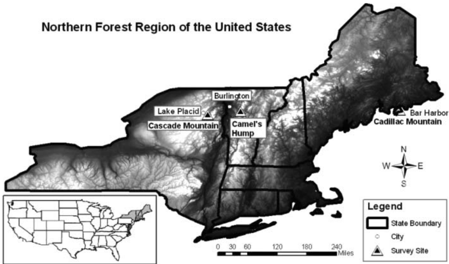
FIGURE 1 Study context in the Northern Forest region of the United States.

in New England, and all peaks above 1,000 feet in Acadia National Park were evaluated for possible inclusion in this study. Only treeless summits were considered due to their finite nature and popularity among recreationists. Cost and the feasibility of sampling were also considerations due to concerns surrounding access during the field season and adequate visitation at areas of low use.